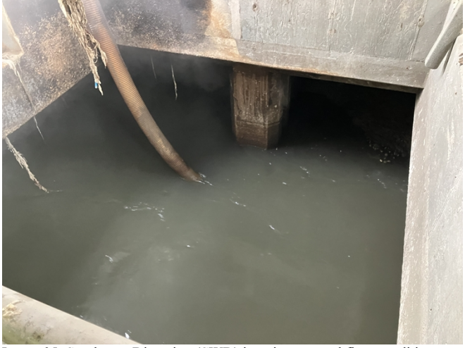
Image 05: Southwest Diversion (SWD) junction, normal flow conditions.

As of November 2023, Baltimore City and the Department have signed a Consent Decree – Case No. 24-C-22-00386 which establishes specific goals and objectives related to the operations and maintenance of the Patapsco WWTP. As a result, maintenance items observed during the site inspection will be notated in the relevant areas above and not itemized in the Violation(s) section as in previous inspection reports.