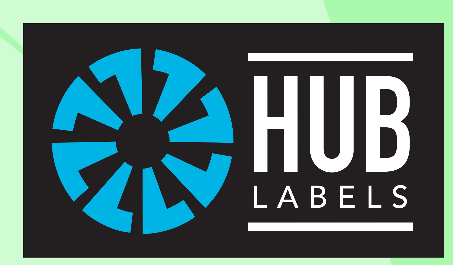
18223 Shawley Drive Hagerstown, MD 21740 www.hublabels.com

Hub Labels is a product label manufacturer with IIO employees at its plant in Hagerstown. The company provides in-house graphics services and offers a variety of label types including linerless labels which eliminate the waste created by backing material. In 2012, Hub Labels implemented a sustainability program called Project L.I.F.E. (Label Initiative for the Environment) which was created specifically for the label industry. Their project team is comprised of employees from various