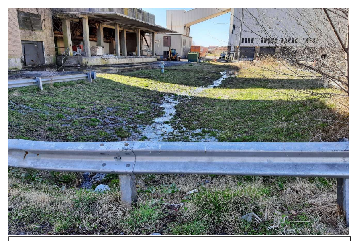
#11 – More contaminated water entering a drainage channel to a culvert.