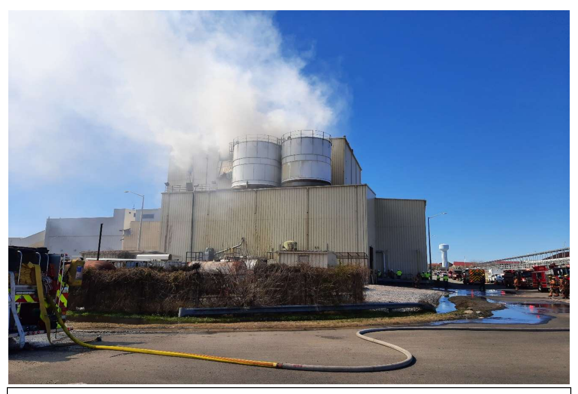
#3 – Looking at east side of pelletizer building. Smoke emanating from building. Water runoff observed from firefighting activities.