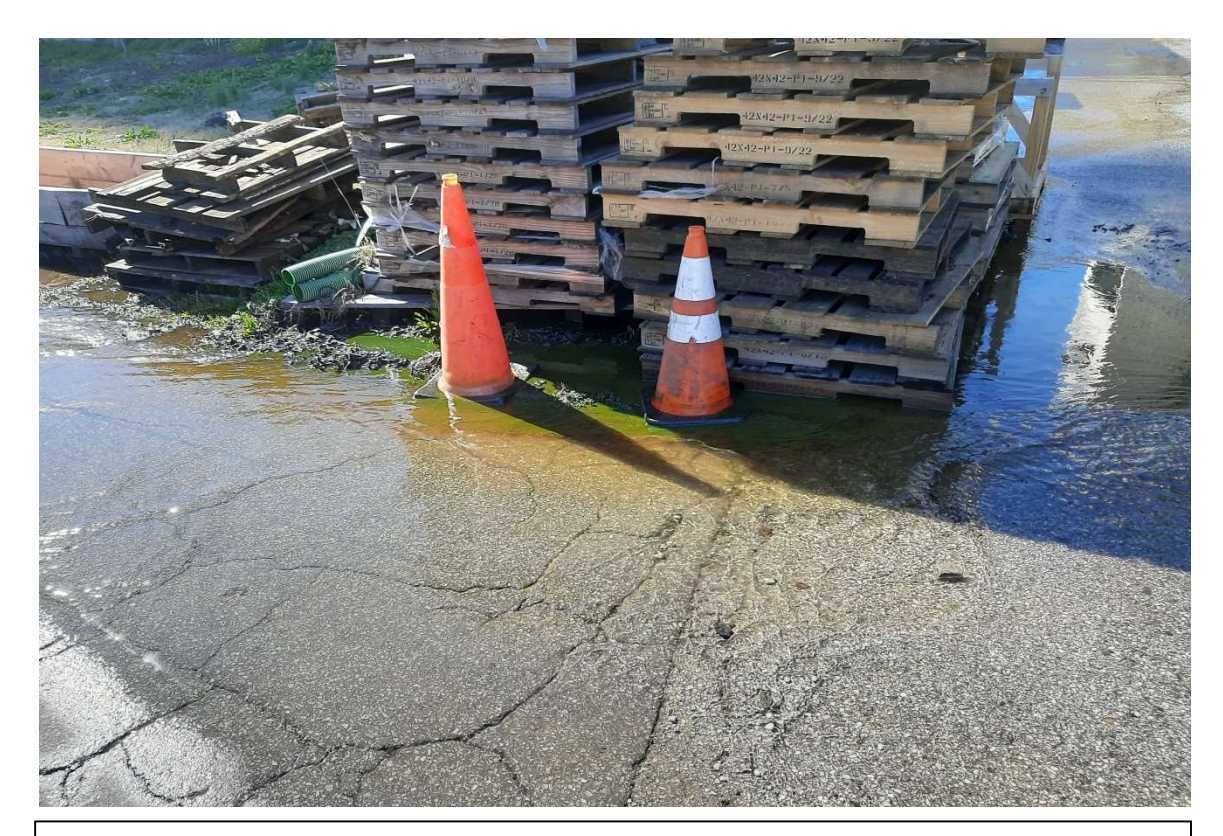
#17 - View of contaminated water.