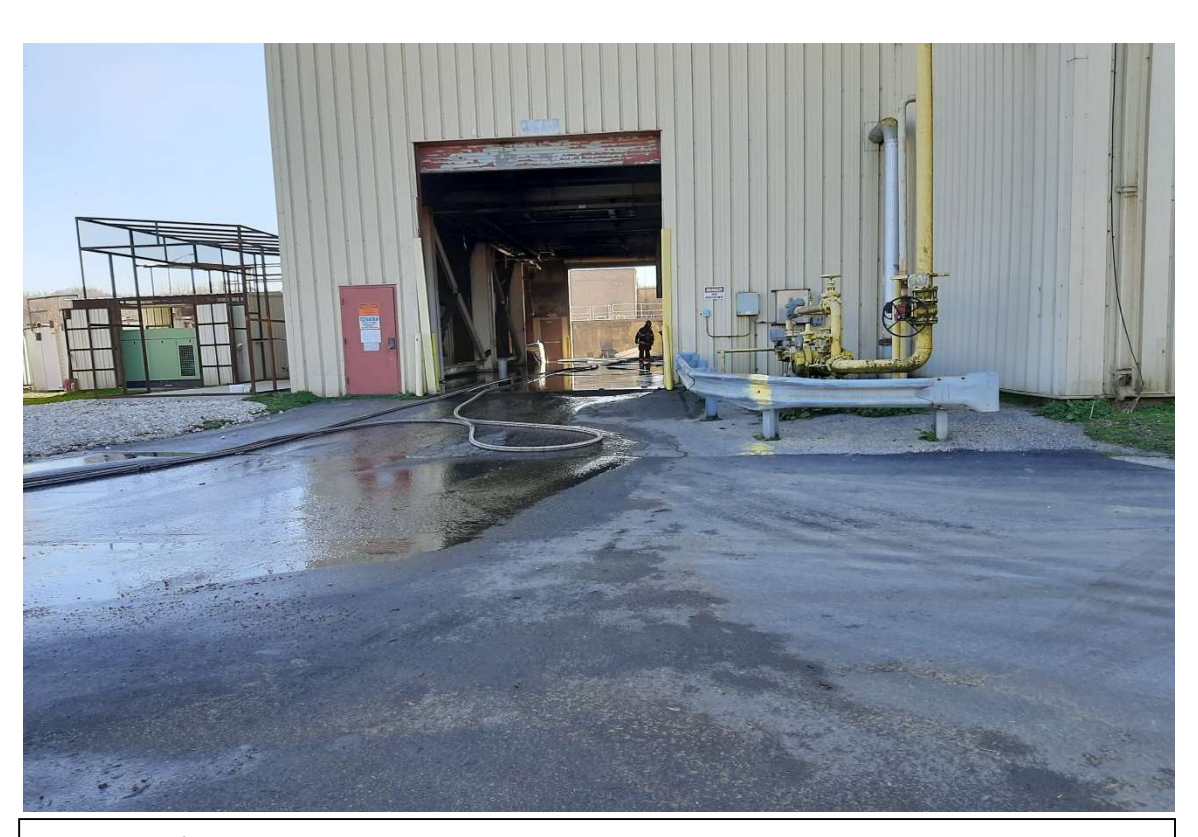
#6 – View of contaminated water exiting the pelletizer building.