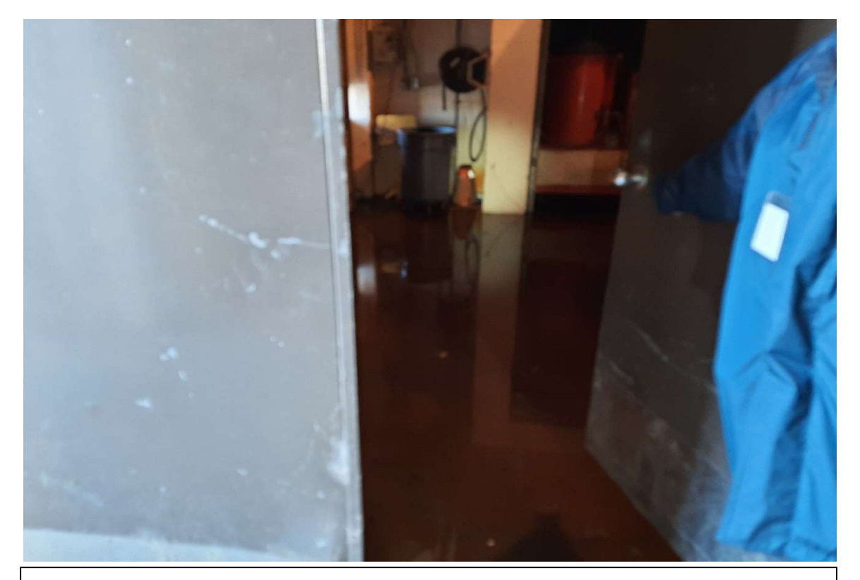
#15 – Contaminated water inside the truck loading building.