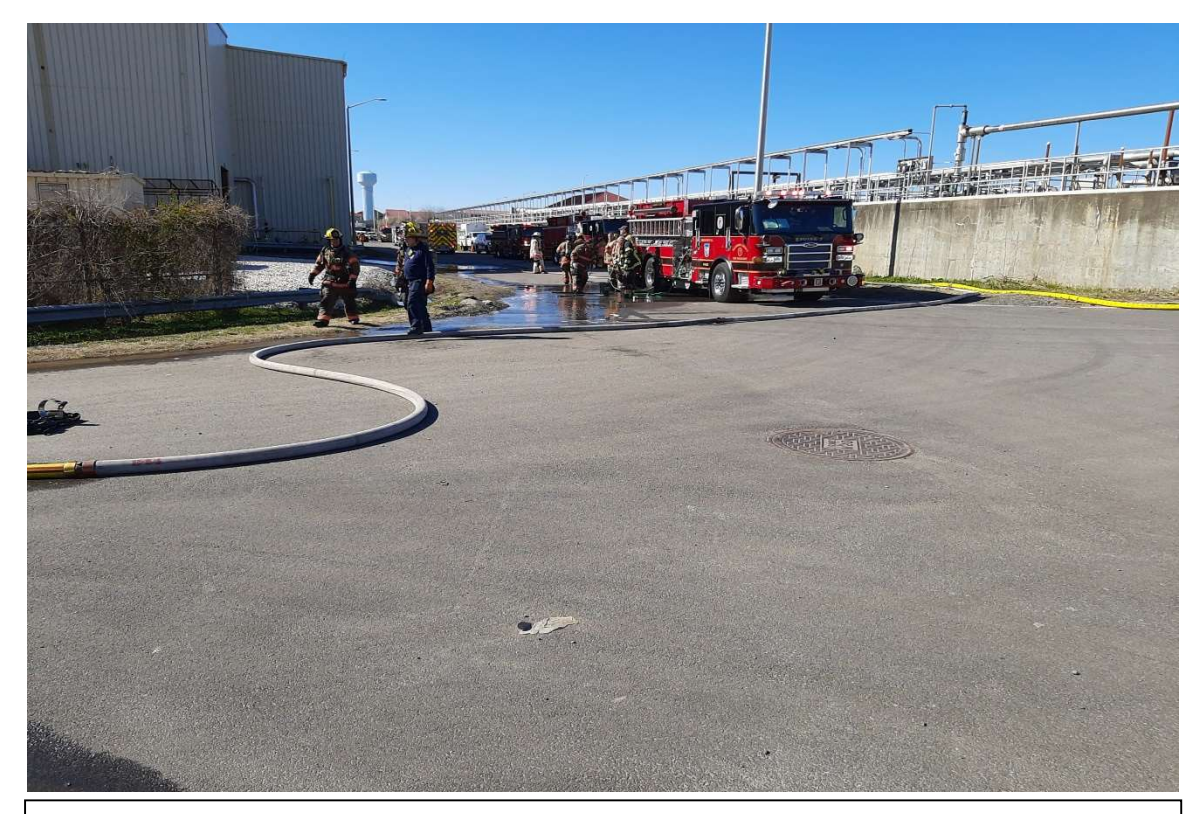
#7 – View of contaminated water flowing away from building along pavement.