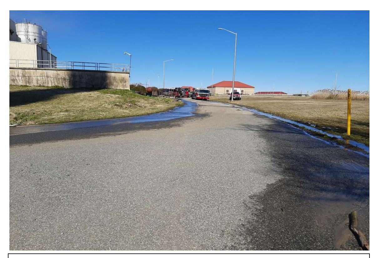
#9 – Contaminated water continues to flow along pavement down towards truck loading building.