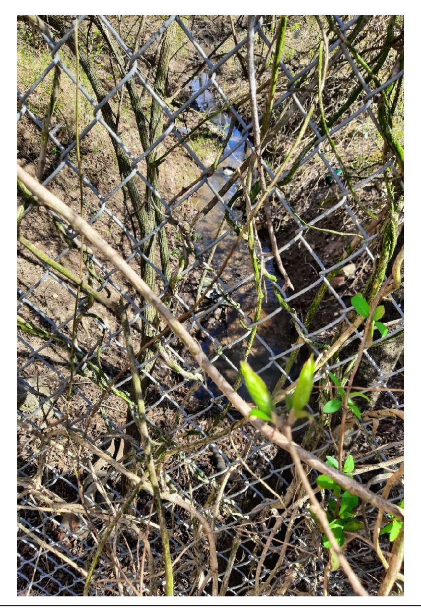
#12 – The culvert discharges to a wetland area that is adjacent to Bread & Cheese Creek.