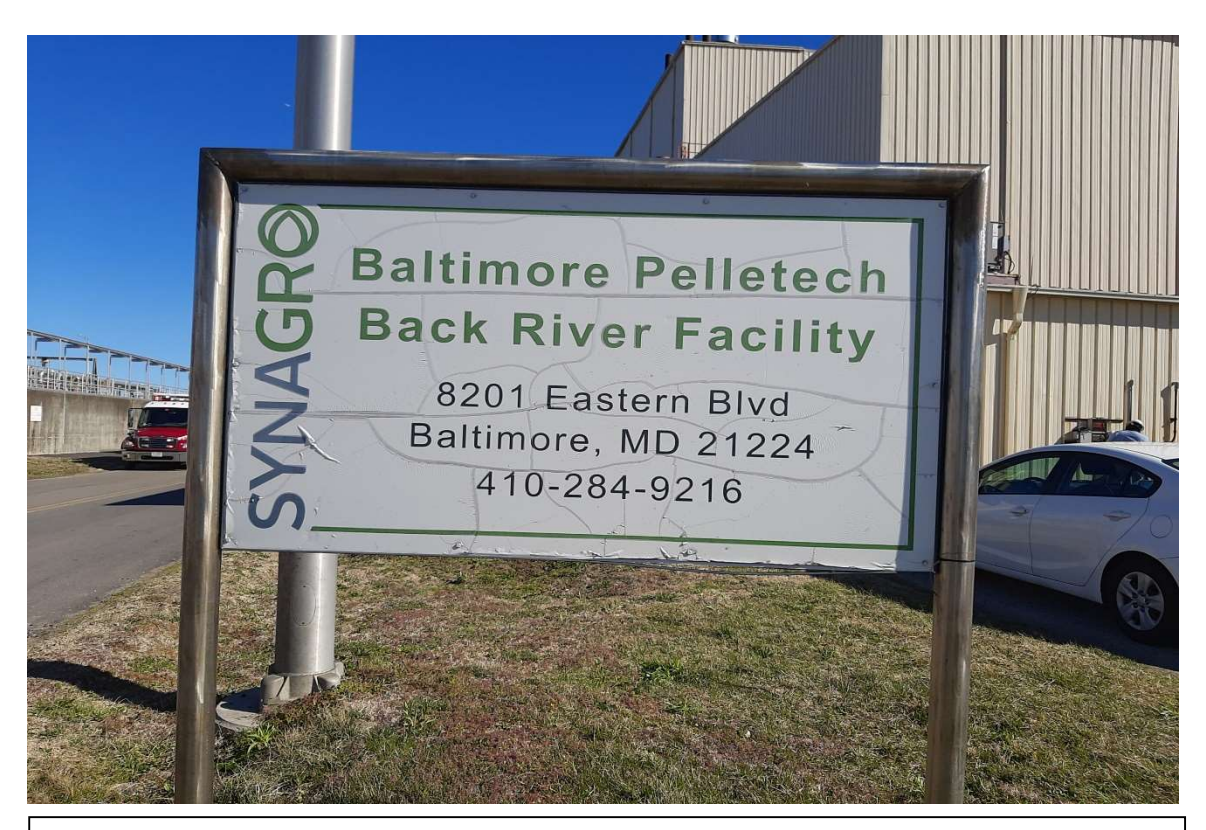
#1 – Synagro pelletizer building sign.