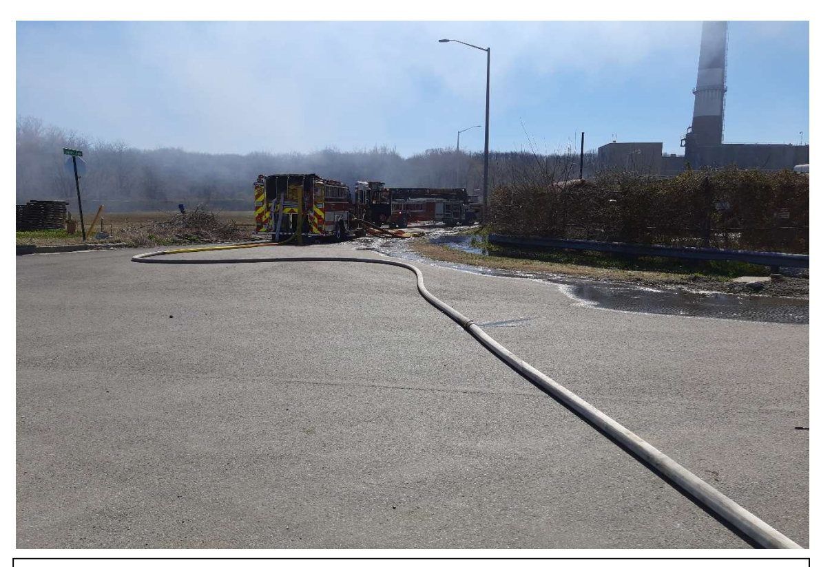
#8 – View of fire truck hooked up to fire hydrant and potable water flowing out of truck onto the pavement.