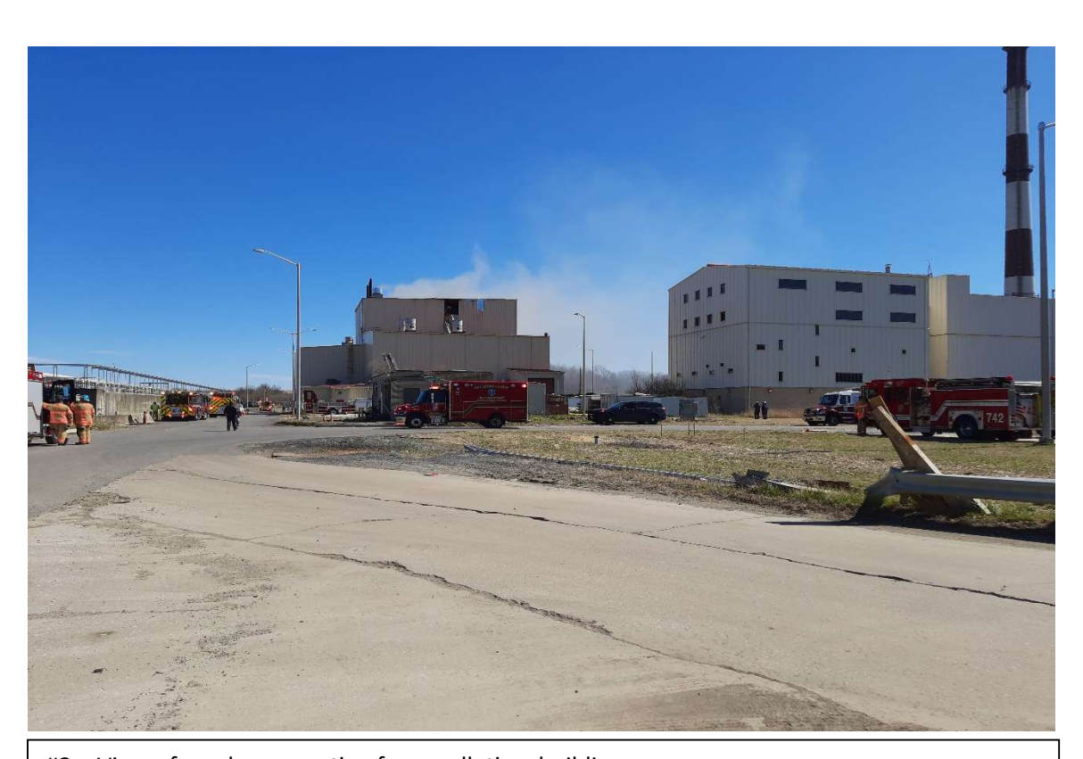
#2 – View of smoke emanating from pelletizer building.