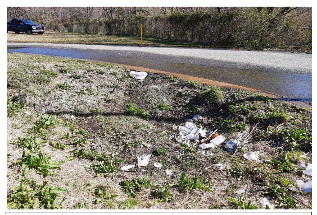
#10 – Some of the contaminated water leaves the pavement and flows onto a vegetated area and into a culvert.