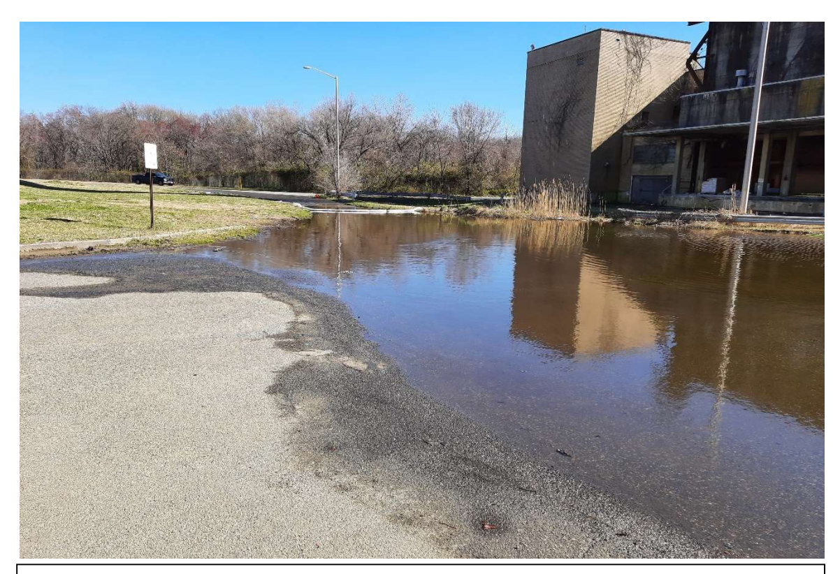
#13 – View of contaminated water as it flows down to the rear of the truck loading building.