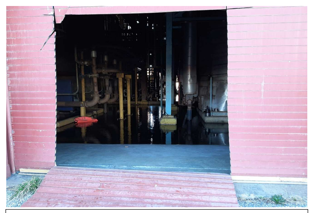
#5 – View of water in first floor of pelletizer building.