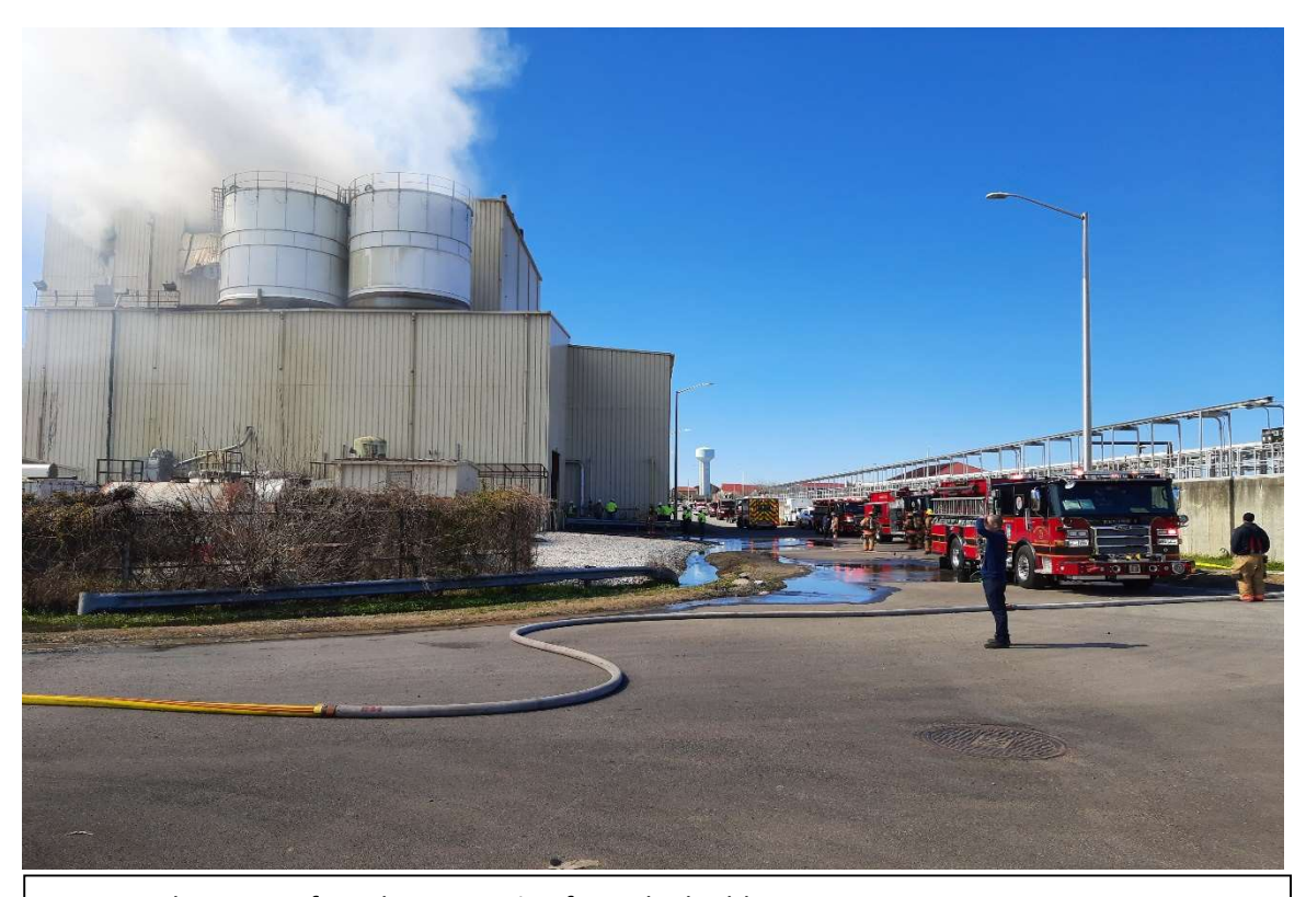
#4 – Another view of smoke emanating from the building.