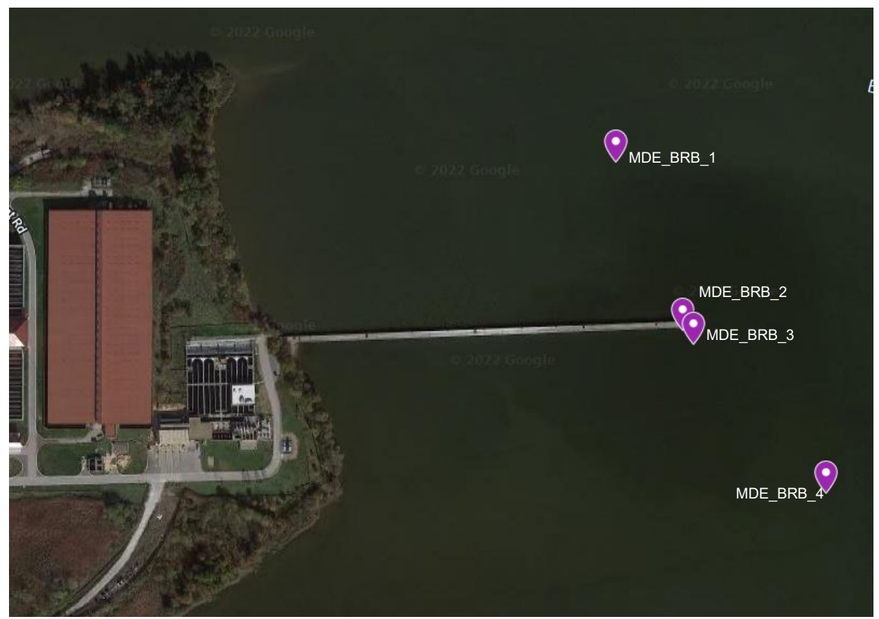
Figure 1: MDE_BRB_1 is 500 feet upriver from the outfall; MDE_BRB_2 is at the outfall; MDE_BRB_3 is 50 feet downriver from the outfall; and, MDE_BRB_4 is 600 downriver from the outfall.

On April 19, 2022, the Maryland Department of the Environment (MDE) began monitoring Back River (Baltimore County) in the vicinity of where the Back River Wastewater Treatment Plant (WWTP) outfall discharges into the river. The purpose of the sampling is to understand how WWTP performance problems may be impacting water quality. Bacterial ( Enterococcus and E. Coli ) sampling is conducted weekly at four sites (Figure 1).